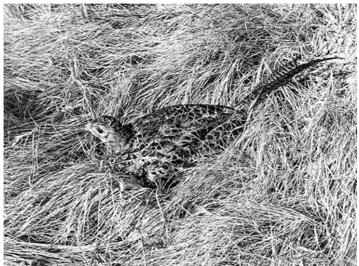
Well-camouflaged hen pheasant in tall grass. Each additional hen that survives the winter increases the odds of better hunting.

But when a severe winter takes a heavy toll on pheasants, conservation management dictates preserving a viable population rather than exploiting adult males. If more males are allowed to survive until winter, fewer productive females will be taken by predators during the winter.