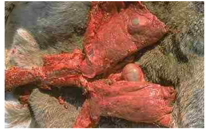
Two hydatid cysts in moose lungs displayed on moose hide.

Throughout Alaska and most of Canada, these cysts are found in moose and some caribou wherever wolves are present. In Alaska, over 300 cases of echinococcosis (hydatid disease) in humans have been reported since 1950 and both Alaska and Canadian F&G agencies publish warnings urging trappers and hunters to wear rubber gloves and protective clothing when skinning or handling a wolf carcass.