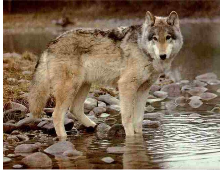
Gray wolf in Yellowstone National Park. Adult males brought from Canada averaged 111 pounds, females 94 pounds.

From 1906-1927, the reported take of large predators from Yellowstone National Park was 127 wolves, 134 mountain lions and 4,352 coyotes. This resulted in speculation that as wolf numbers decreased the number of coyotes increased.