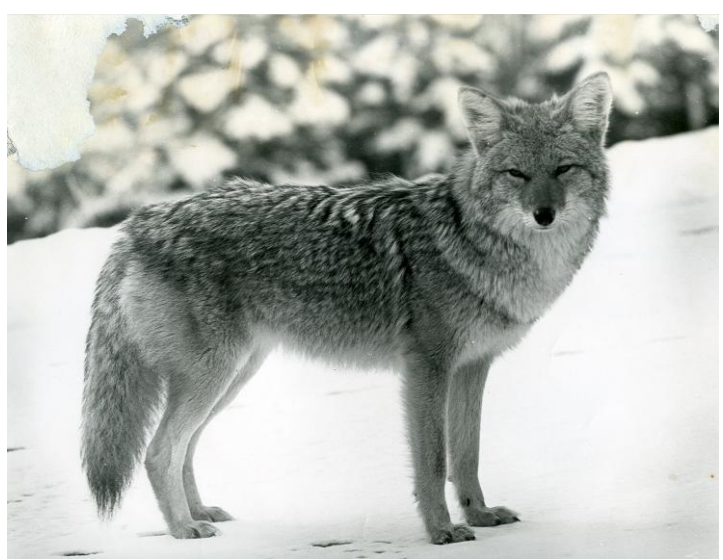
Coyote in Yellowstone Park. Adult males in the Northern range average 30 pounds, females 26 pounds.

British biologists realize that it is unrealistic to attempt to go back in time 8,000 years to the mesolithic period when man was a tribal hunter and bears and wolves were next in line, dominating the lessor predators in the food chain hierarchy. With the exception of animal rights extremists who recently outlawed fox hunting, many British biologists believe we should intervene and manage existing wildlife species just as we manage forests and farms.