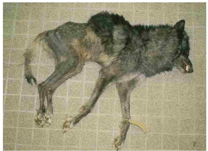
Gray wolf that died as a result of sarcoptic mange.

Sarcoptic mange has been confirmed by testing in three wolf packs just east of Yellowstone Park and in one northwest of the Park in Montana. All wolves that are captured for collaring or other reasons are reportedly being injected with Ivermectin in the hope it might help the healthier animals fight off the infection.