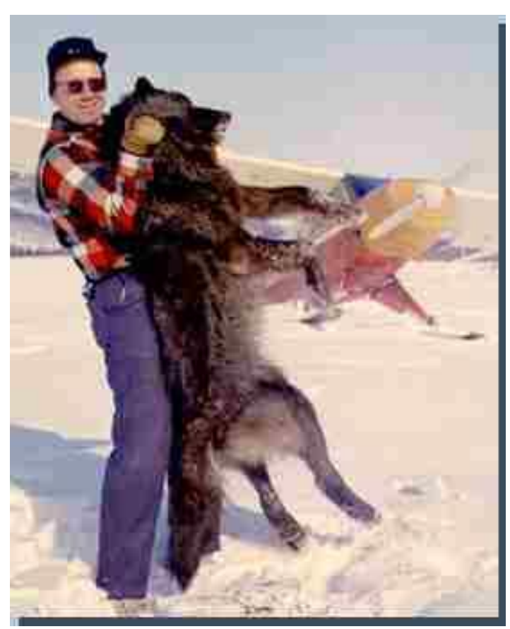
Photo by Leroy Shebal of black wolf taken using ski-equipped Piper Super Cub.

Coyne's article describes a scene from a movie produced in 1967 by well-known Alaska Master Guide and bush pilot Leroy Shebal in which a gray wolf was apparently missed by an aerial hunter with the first shot, wounded with the second and killed with the third. Although the film received rave reviews when it was shown all over the U.S. in 1969-71, wolf advocates now denounce it as an example of "inhumane" wolf control.